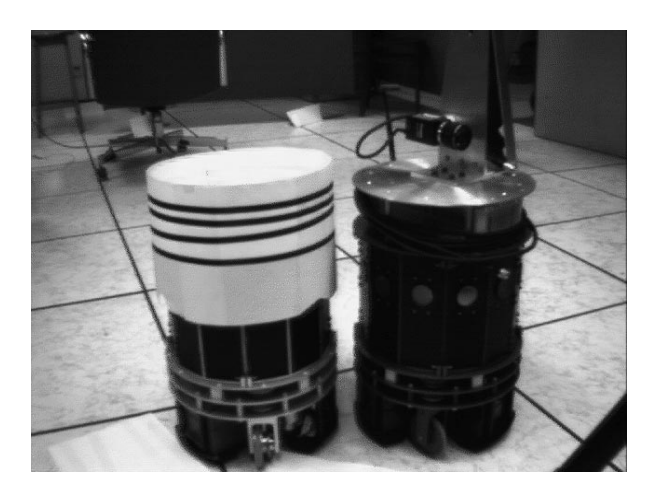
Figure 1: Robots used in the experiments. The leader robot (Rosie), is on the left while the follower (Agamemnon) is on the right. The upper part of Rosie has been covered with a pattern which is used to communicate to Agamemnon.

There is considerable research interest in the task of having one autonomous vehicle follow another (c.f. [4, 11]). This task is usually implemented as only a single robot following some other autonomous agent. In practice, a variety of strategies are available for implementing this type of inter-robot collaboration. In previous applications it is assumed that the target to be followed does not actively aid in the process of being followed but rather that the follower must