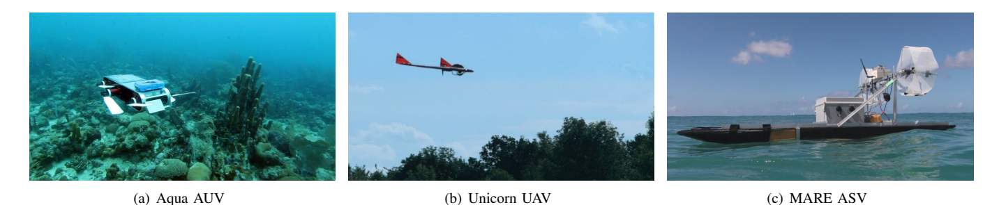
Fig. 2. Our robot team consists of (a) the Aqua AUV, an agile legged underwater robot, (b) the Unicorn, a fixed-wing UAV with an on-board autopilot and gimbal-mounted camera, and (c) the Marine Autonomous Robotic Explorer (MARE) catamaran ASV, which can operate in turbulent open water regions.

coral species, and sand etc... Given such a descriptor, we then use an online summarization algorithm which tries to identify samples, which cover the set of all observations, in this low dimensional semantic space. Since all observations must be covered, the summarizer encourages outliers to be part of the summary, which can be interpreted as surprising observations.